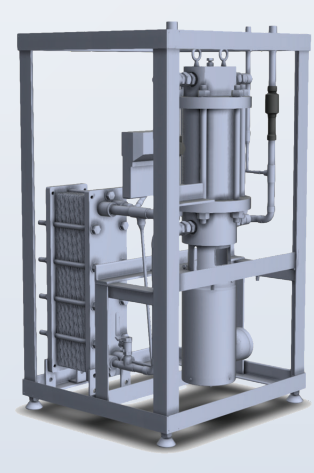
2ft x 2ft x 4ft